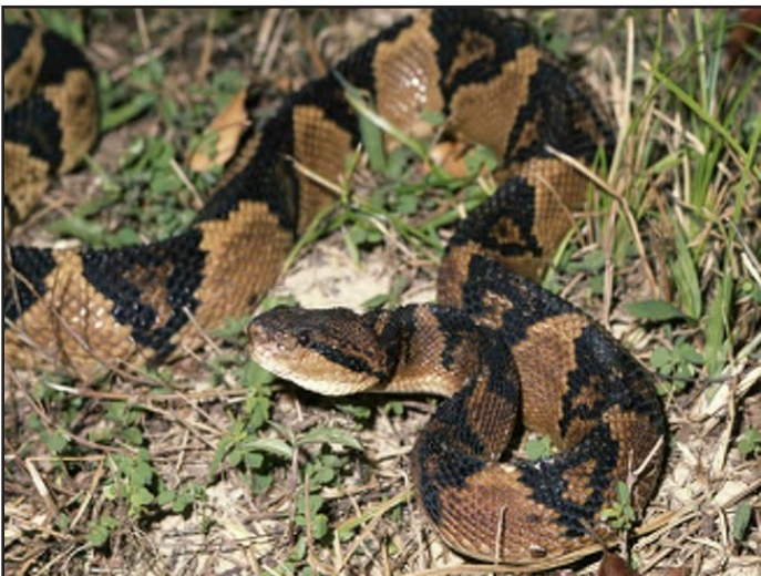
Mapepire zanana (Bushmaster)