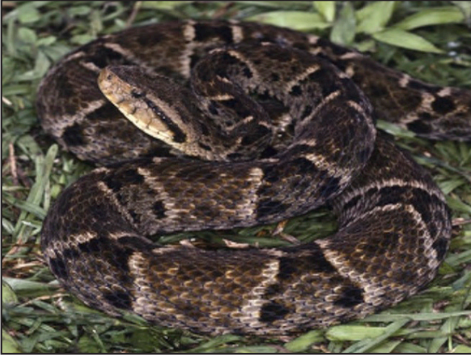
Mapepire balsain (Fer-de-lance)

THERE ARE FOUR SPECIES OF DANGEROUSLY VENOMOUS SNAKES NATIVE TO TRINIDAD, AND NONE OCCUR IN TOBAGO